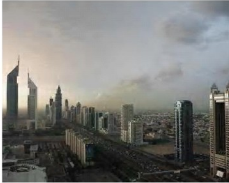
The same street in 2003