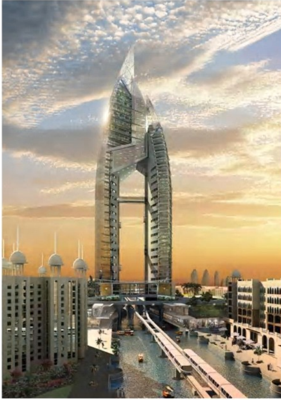
The Trump International Hotel & Tower, which will be the centerpiece of one of the palm islands, The Palm Jumeirah.