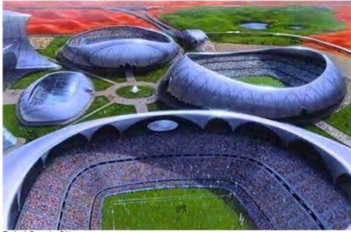
Dubai Sports City . A huge collection of sports arenas located in Dubailand.