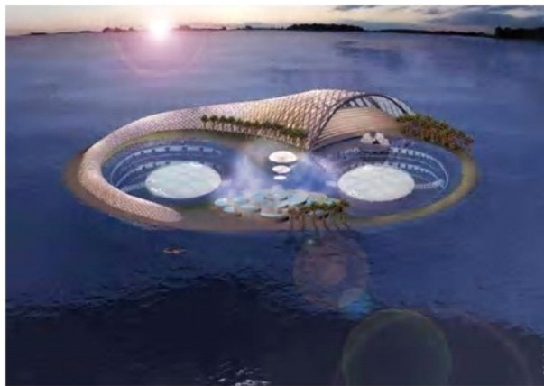
Hydropolis, the world's first underwater hotel.

Entirely built in Germany and then assembled in Dubai, it is scheduled to be completed by 2009 after many delays.