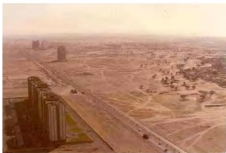
Dubai in 1990