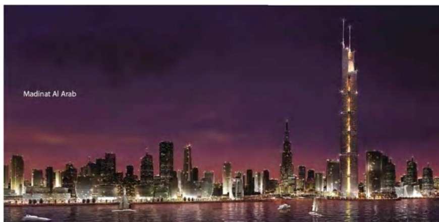
The Dubai Waterfront. When completed it will become the largest waterfront development in the world .