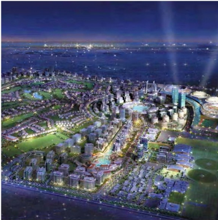
Currently, the Walt Disney World Resort is the #1 tourist destination in the world. Once fully completed, Dubailand will easily take over that title since it is expected to attract 200,000 visitors daily.