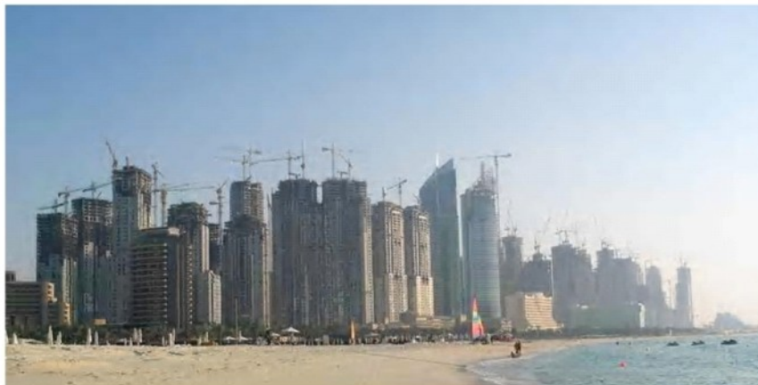
The madness. Dubai is said to currently have 15-25% of all the world's cranes .