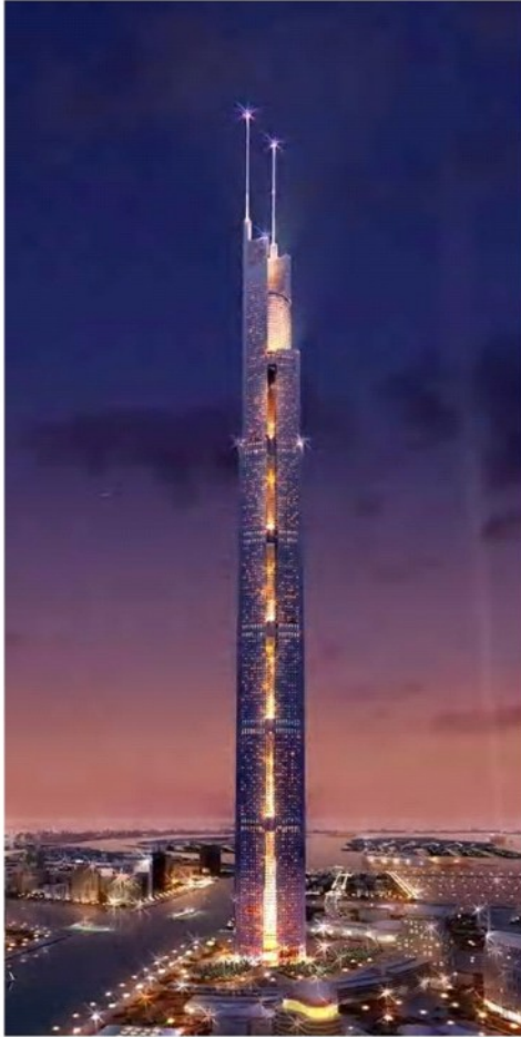
The Al Burj. This will be the centerpiece of the Dubai Waterfront. Once completed it will take over the title of the tallest structure in the world from the Burj Dubai.